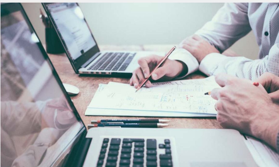
Traditional data entry process with a manual and time-consuming approach

Costs for similar services range from $1,000 to $1,500 for a consultant plus building operator time to assist.